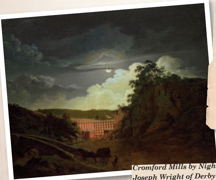
Cromford Mills by Night, Joseph Wright of Derby c1780s

The Torrington Diaries Viscount Torrington 1790